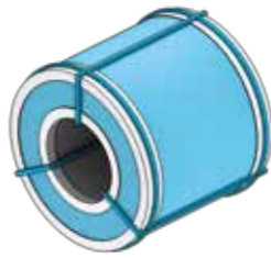
RS4 / 5

NON-STANDARD PACKAGING IS DEVELOPED ACCORDING TO CUSTOMER REQUEST