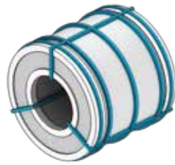
RS2 / 3 / 6